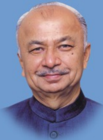
Shri Sushilkumar Shinde Hon'ble Union Minister of Power