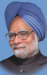
Dr. Manmohan Singh Hon'ble Prime Minister of India