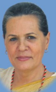
Smt. Sonia Gandhi Hon'ble Chairperson, UPA