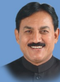
Shri Bharatsinh Solanki Hon'ble Minister of State for Power

“ Our natural resources are limited. We must use them more efficiently. We need a new culture of energy conservation.”