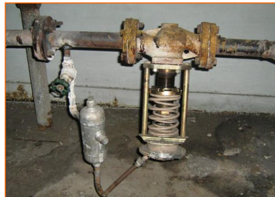
Pressure reducing valve to PRS