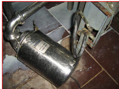
New pump with efficient motor