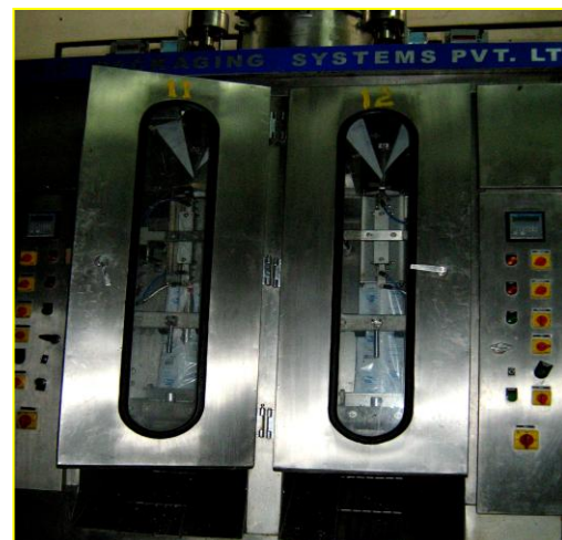
New mechanical packing m/c

New machine output - 38 pack/ min X2 -76