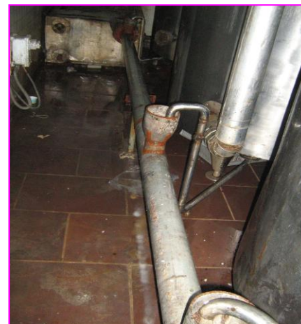
New 4" GI pipe