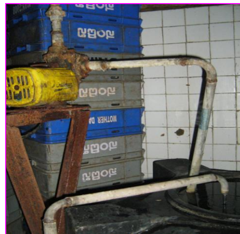
Water circulation system