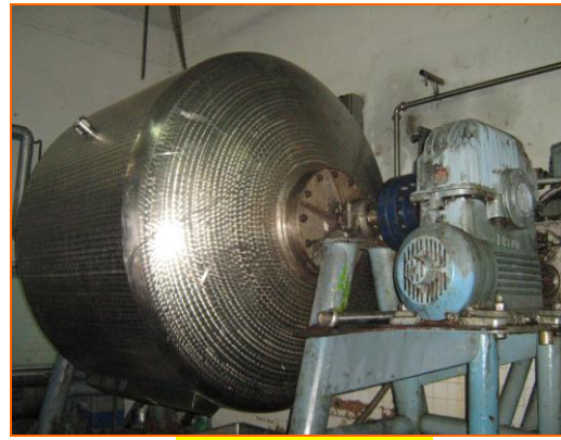
Old butter churn