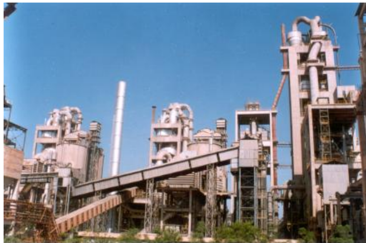
PLANT VIEW - VIKRAM CEMENT LINE-2 AT CENTER

Vikram Cement Vision is “To be the world class cement plant producing, best quality of composite cement at optimum cost with Eco-friendly, safe and healthy environment” .