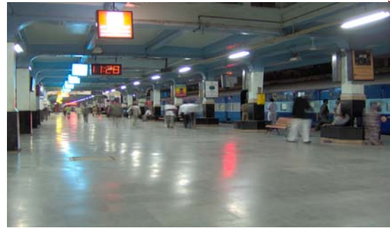
Illumination at Secunderabad station platform