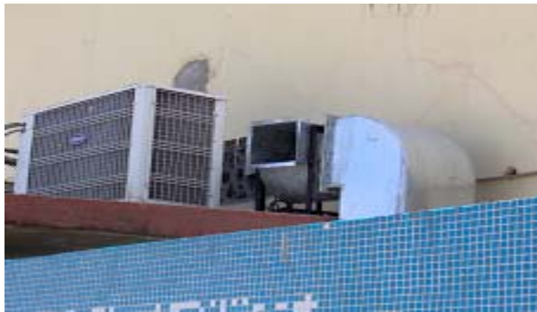
Induced draft Ventilation for AC Waiting Hall HYB Stn.: