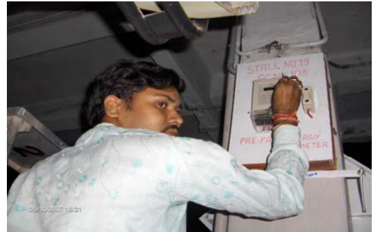
Owner topping up energy meter by prepaid top up card