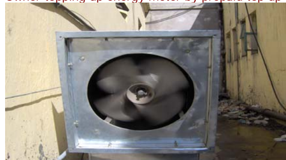
Induced draft fan on vents at Secunderabad waiting hall.