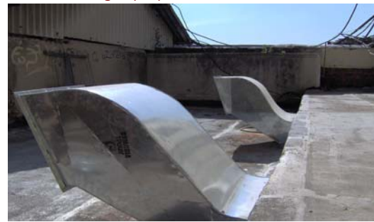
Stale air vents on roof at Secunderabad waiting hall