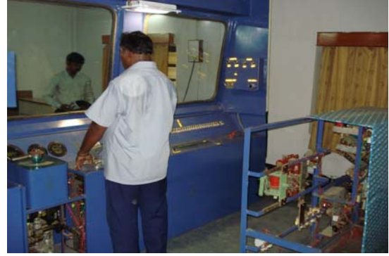
Inside the simulator