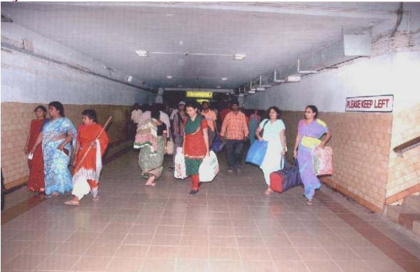
Subway ventilation at Guntur