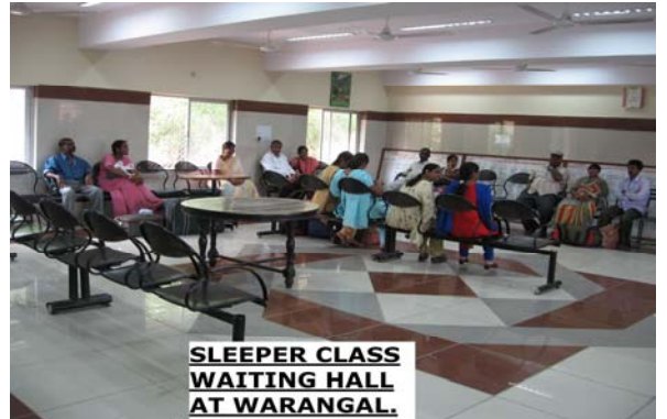
SLEEPER CLASS WAITING HALL AT WARANGAL.