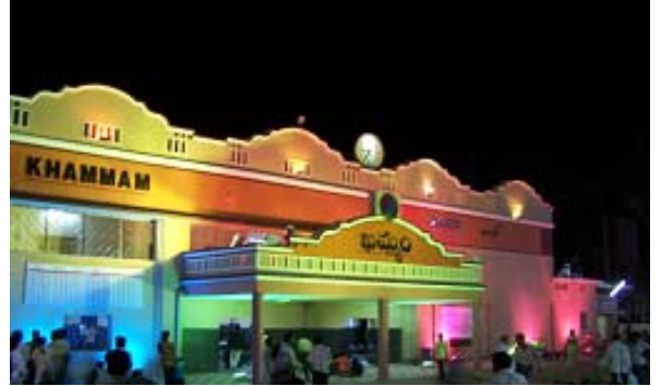
Circulating area at Khammam