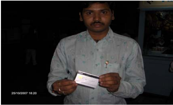
Owner holding top up card.