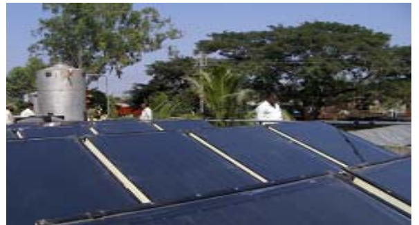
solar water heaters at running room.