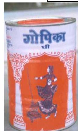
Butter Oil 316 MT

- GSK - Nabha Contribution to GSK - India Cx Volumes at 55% for 2006