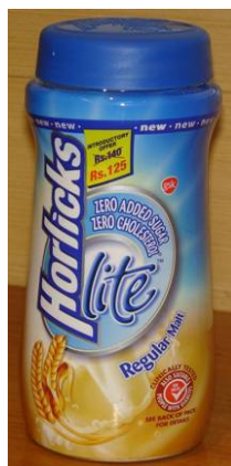
Horlicks Lite 660 MT