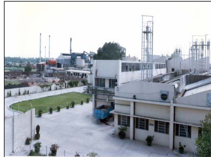
2006 @ 46.9 KT (with 14 Lines operation & all product mix)