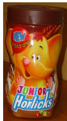
Jr. HLX Choc. 80 MT