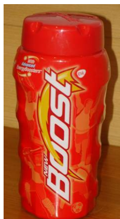
Boost 7602 MT