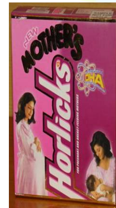
Mother HLX 507 MT