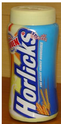
Vanilla HLX 145 MT