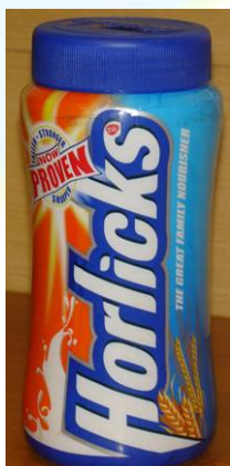
Horlicks 11732 MT