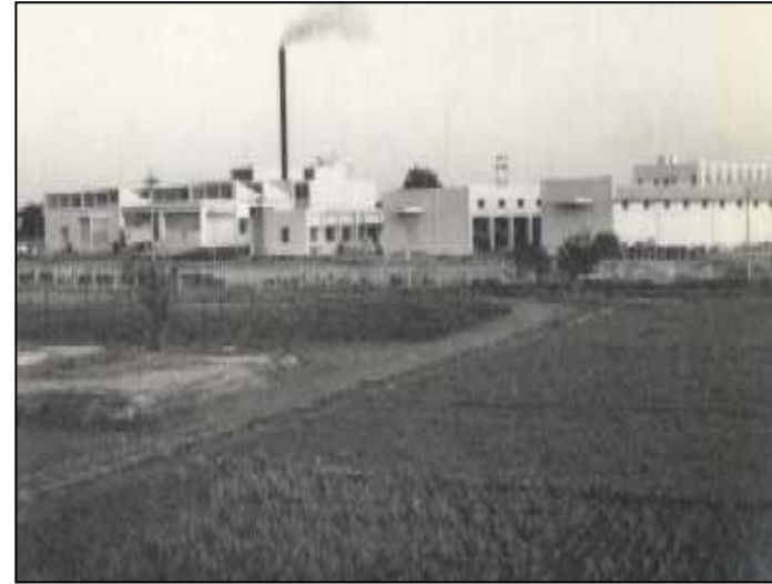
March'1960.... The beginning at 2 KT

Nabha is the flagship site of GSK CH India network with almost 55% of nutritional health powders coming from Nabha. The site has grown from a 1 unit-1 line plant to a 3 units-14 lines production plant. The production capacity has grown from 2 Kilo Tonnes Horlicks production to 51 Kilo Tonnes (Includes Horlicks, its variants and other health drinks).