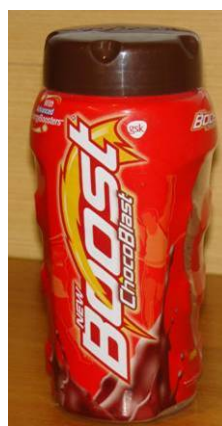
Boost C. Blast 116 MT