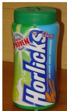
Elaichi HLX 250 MT