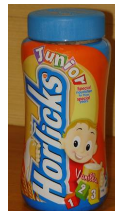
Jr. Horlicks 4300 MT