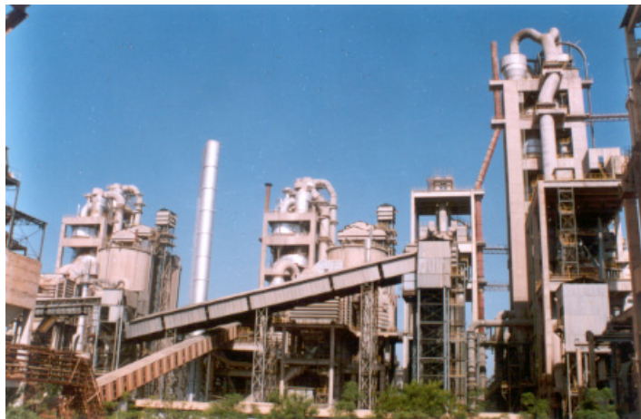
PLANT VIEW - VIKRAM CEMENT LINE-1 IS FIRST FROM LEFT

Vikram Cement Vision is “To be the world class cement plant producing, best quality of composite cement at optimum cost with Eco-friendly, safe and healthy environment”.