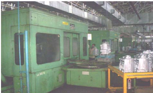
HMC machining centre