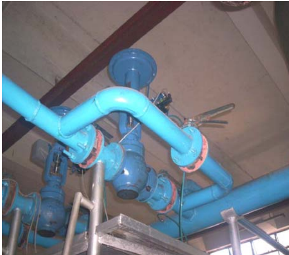
PID Flow controlled valves. (Separate for LP & HP)