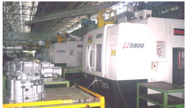
MAZAK machining centre