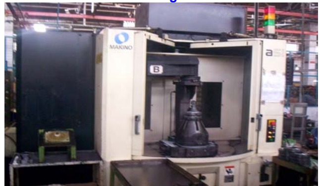
MAKINO machining centre

Agency that executed the project (with complete address and email): M/S MAZAK Japan, MAKINO Japan, NTC Japan