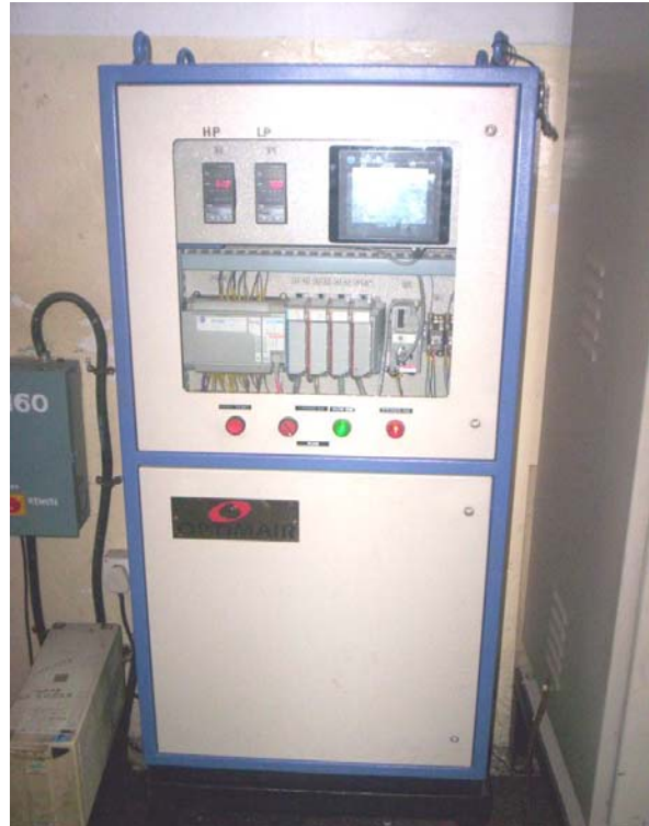
PLC controller for interconnection of air compressor.

Agency that executed the project (with complete address and email):