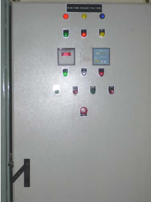
FUME EXHAUST SYSTEM : 75KW VFD