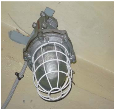
27 W CFL in place of 160 W mercury lamp