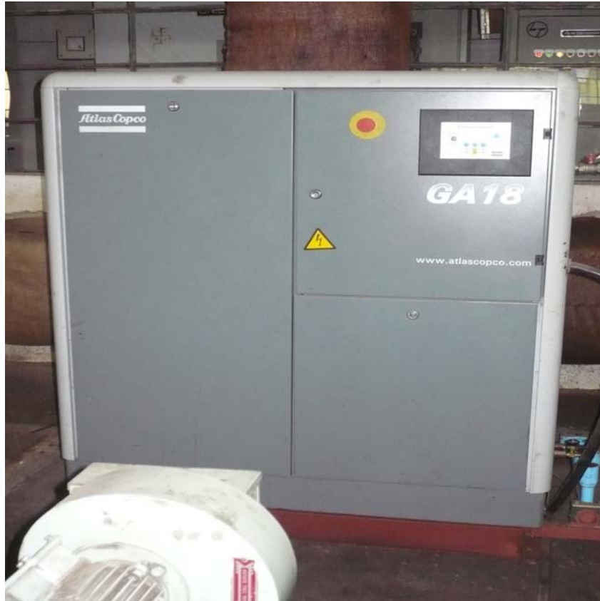
AIR COMPRESSOR PANEL 18.5 KW

One no. Separate Air compressor 18.5 kw was installed in Cut-to-length line for providing Compressed air supply to the machine. Earlier air supply was through centralized 125 kw compressors which has to run some times only for CTL machine. Due to this modification power consumption is reduced to 3000 Kwh/month.