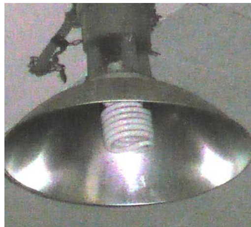
90 W CFL in place of 150W HPSV lamp

1. Total 68 nos. 20W CFL replaced in place of 40w tube lights. These were installed in August 2006 with investment of Rs. 7140 and Kwh saving of 5875kwh till March 2007 ie saving of Rs. 26,613.00