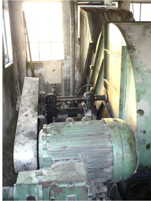
FUME EXHAUST SYSTEM : 75 KW AC MOTOR

One no. Variable frequency drive was installed to stop the fume exhaust motor during no coil rolling period in cold rolling mill thereby reducing the fix power consumption of cold rolling mill. (Frequent start /stop was not advisable with earlier 75 KW DOL starter, hence Fan was running continuously during no coil rolling period.) Due to this modification power consumption in cold rolling mill area is reducing @10,000 kwh/month.