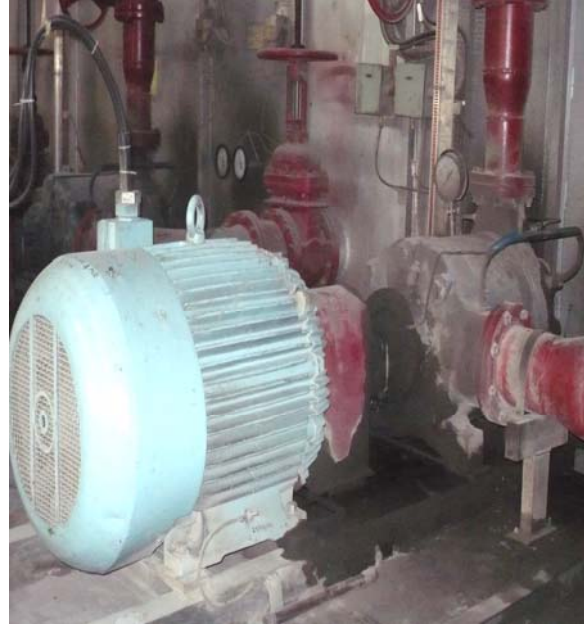
ROLL COOLENT FEED PUMP AC MOTOR

One no. Variable frequency drive was installed to stop the feed pump motor during no coil rolling period in cold rolling mill thereby reducing the fix power consumption of cold rolling mill (Frequent start /stop was not advisable with earlier 110KW DOL starter, hence pump was running continuously during no coil rolling period.) Due to this modification power consumption in cold rolling mill area is reducing @ 15000 kwh/month.