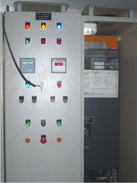
ROLL COOLENT FEED PUMP 110KW VFD