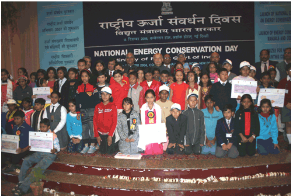
Group photograph of National Level Painting Competition 2006 with H'ble Minister of Power Shri Shishilkumar Shinde