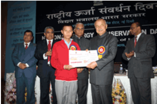
BEE Consolation Prize