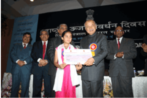
2 nd Consolation Prize