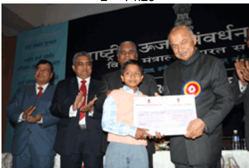
3 rd Prize