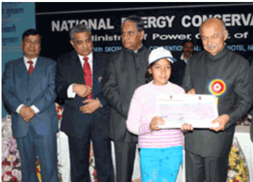
4 th Consolation Prize