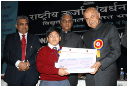
1 st Prize