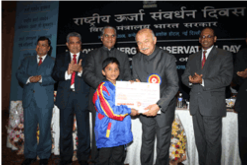
BEE Consolation Prize