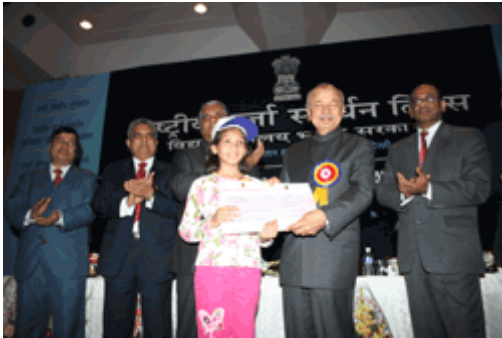
3 rd Consolation Prize