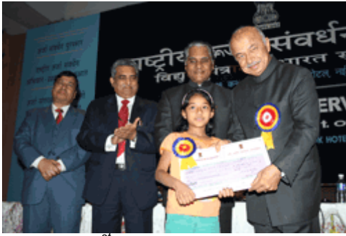
1 st Consolation Prize