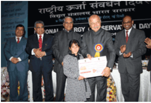
BEE Consolation Prize