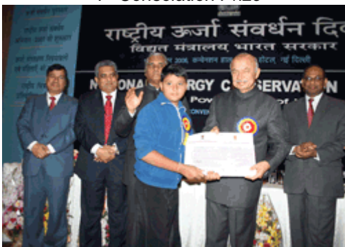
5 th Consolation Prize