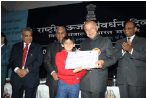
2 nd Prize