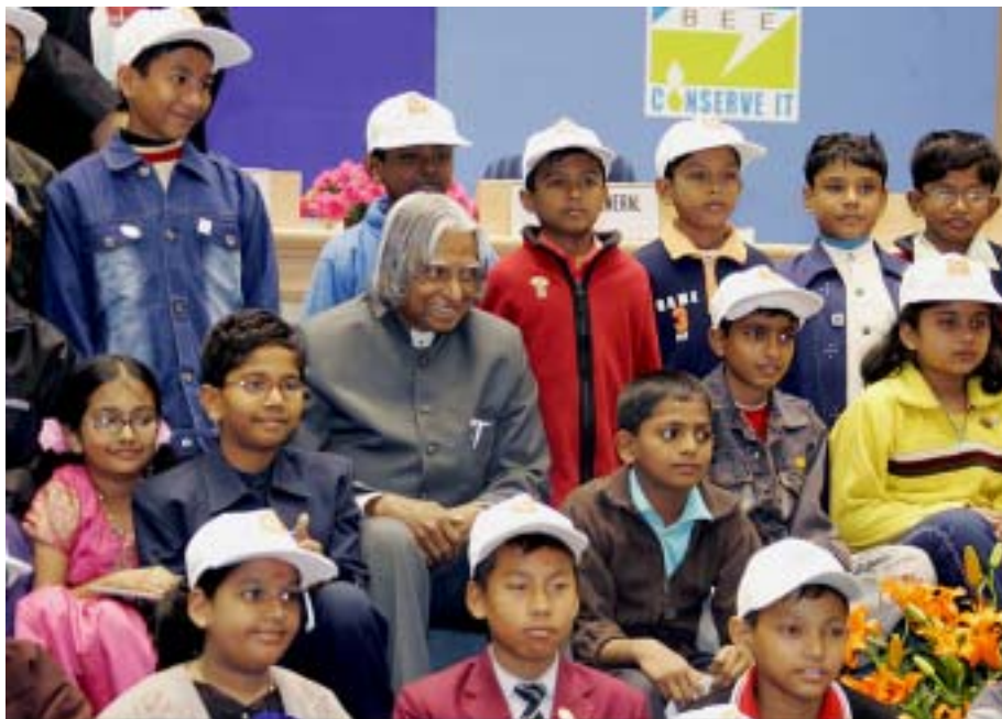
Participating students of National Painting Competition with Hon'ble President of India, Dr. A.P.J. Abdul Kalam at Vigyan Bhawan, New Delhi on National Energy Conservation Day (14 th December 2005)