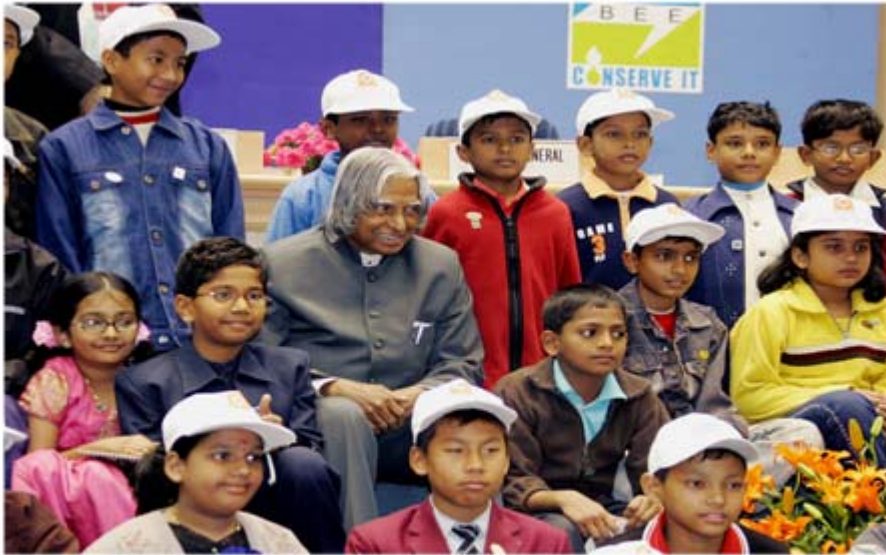
Participating students of National Painting Competition with Hon'ble President of India, Dr. A.P.J. Abdul Kalam at Vigyan Bhawan, New Delhi on National Energy Conservation Day (14th December 2005)