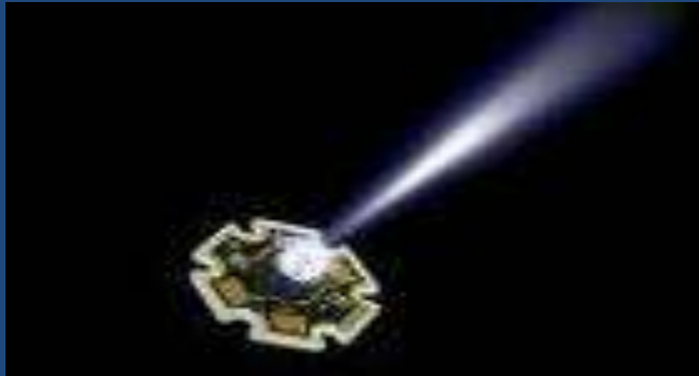
Light Emitting Diodes