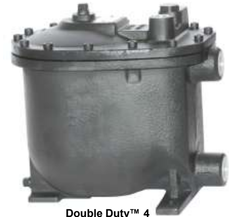
Double Duty™ 4