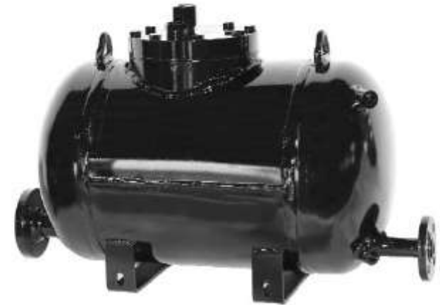
Double Duty™ 6